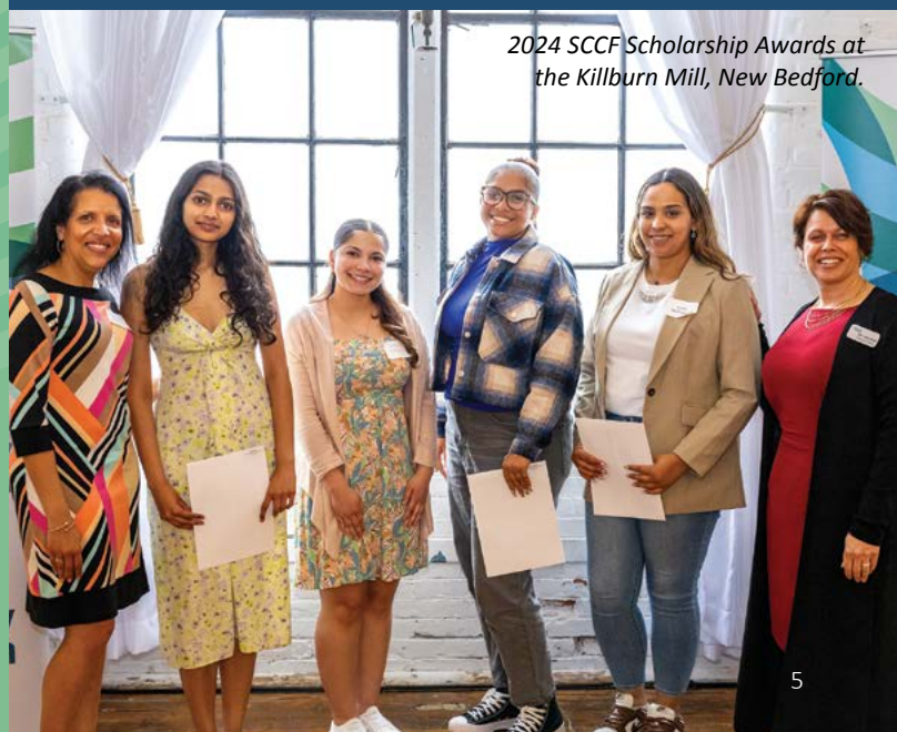
2024 SCCF Scholarship Awards at the Killburn Mill, New Bedford.

* Approximately 73% of grants were directed by the Foundation's donors, and 27% were Foundation-directed.