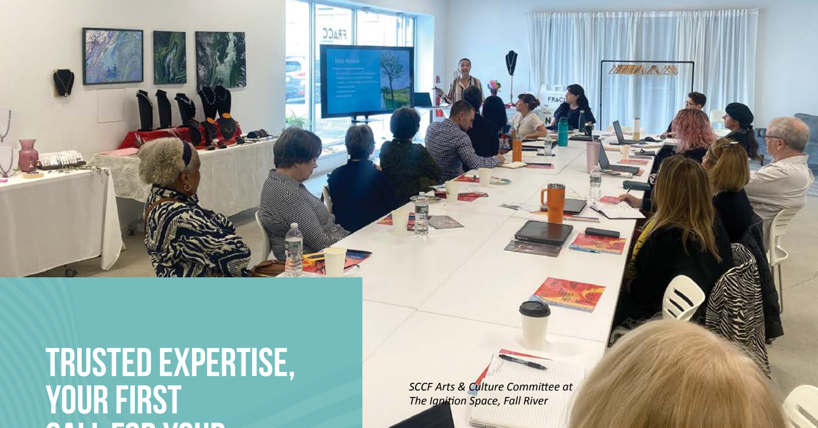
SCCF Arts & Culture Committee at The Ignition Space, Fall River