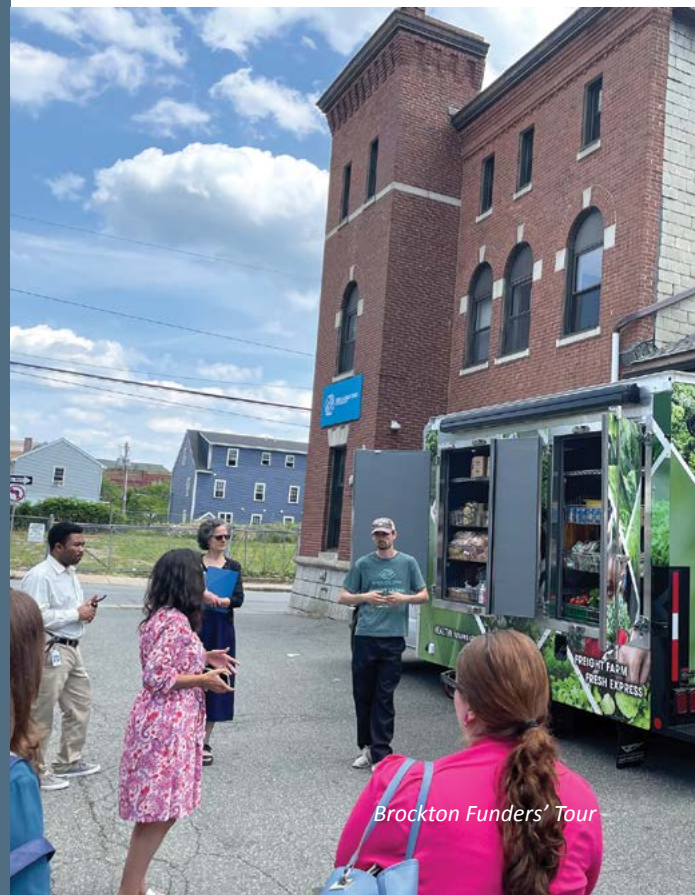
Brockton Funders' Tour

These conversations reaffirmed our purpose and strengthened our resolve. They are shaping how we lead, how we listen, and how we move forward—together.