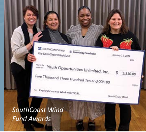
SouthCoast Wind Fund Awards