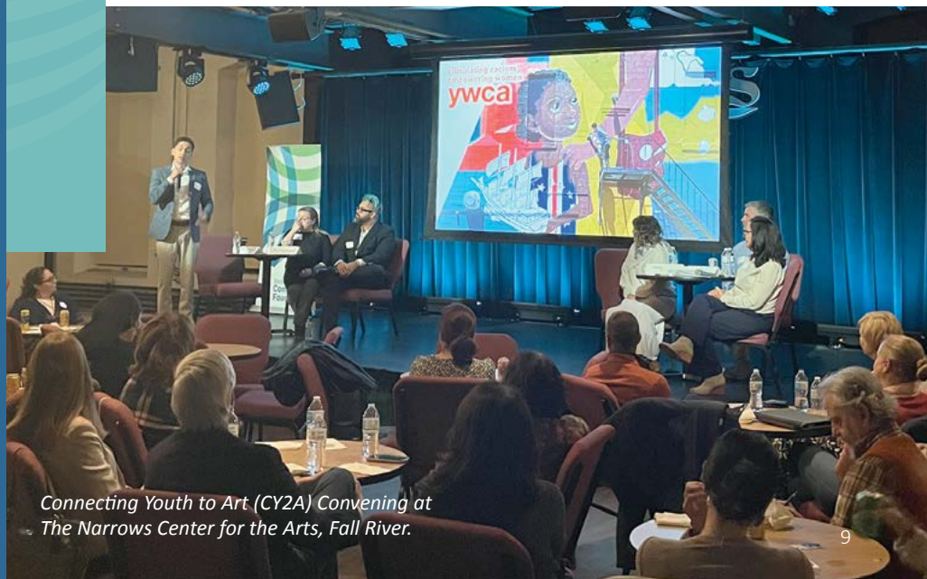
Connecting Youth to Art (CY2A) Convening at The Narrows Center for the Arts, Fall River.

Trusted Expertise is a cornerstone of our strategy and a responsibility we take seriously. We are committed to being the trusted philanthropic partner of choice in Southeastern Massachusetts, offering the highest level of service, insight, and care to every donor, advisor, and nonprofit we support. That includes using data to inform our decisions, guide our investments, and ground our work in the lived realities and strengths of the communities we serve. We are committed to learning from success—locally, regionally, and nationally, and to working alongside others to make data more accessible, so everyone, from donors to fellow funders to grassroots leaders, can lead with insight and purpose.