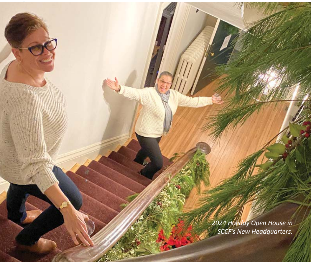
2024 Holiday Open House in SCCF's New Headquarters.

Looking ahead, 350 Union Street will host fund advisor gatherings, grantee convenings, cross-sector collaborations, and shared learning opportunities. It will be a hub for civic dialogue and community-driven innovation, a place where bold ideas, trusted partnerships, and regional vision come together to shape a stronger, more connected SouthCoast.