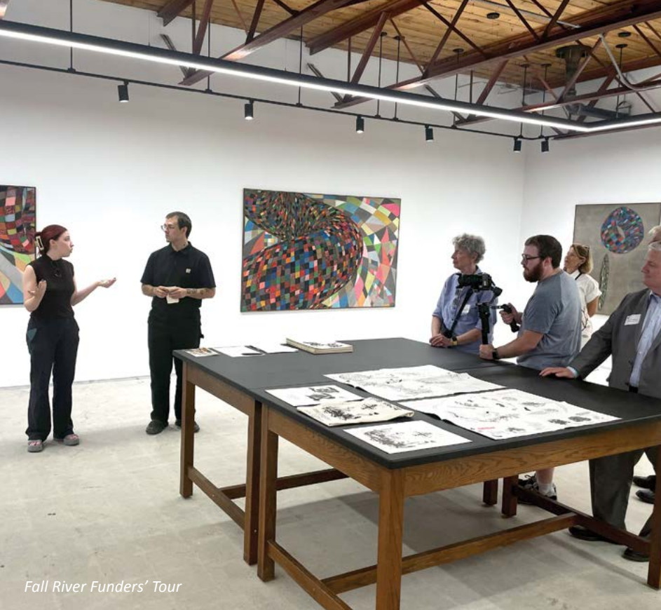
Fall River Funders' Tour