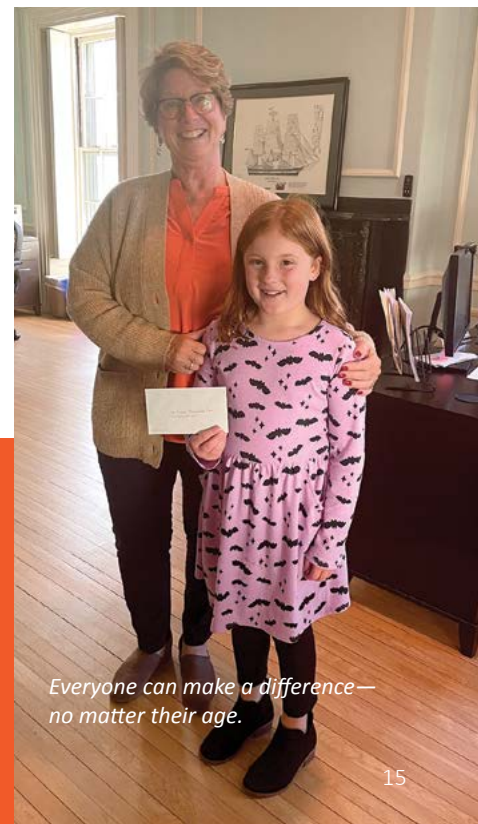
Everyone can make a difference — no matter their age.

With over 30 years of trusted asset management and philanthropic stewardship, we will work with you to create a giving plan that reflects your vision and creates meaningful, long-term impact. Your best gift may be your last — and your most enduring. Let's shape your legacy, together. Be a founding member of our SouthCoast Legacy Society.